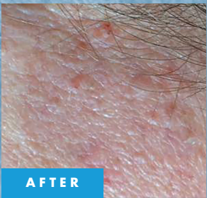
Actinic Keratosis Treatment